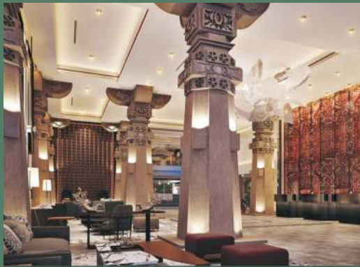
@ Dusit Princess Lobby