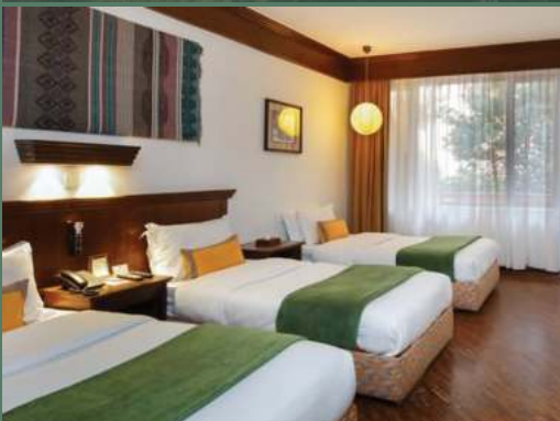
@ Club Himalaya Resort Room