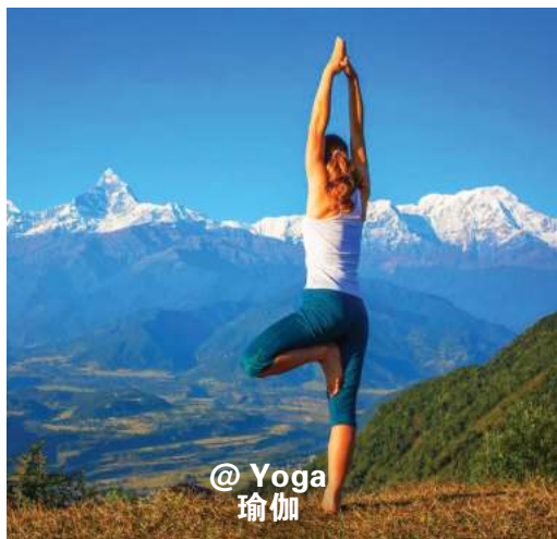
@ Yoga 瑜伽