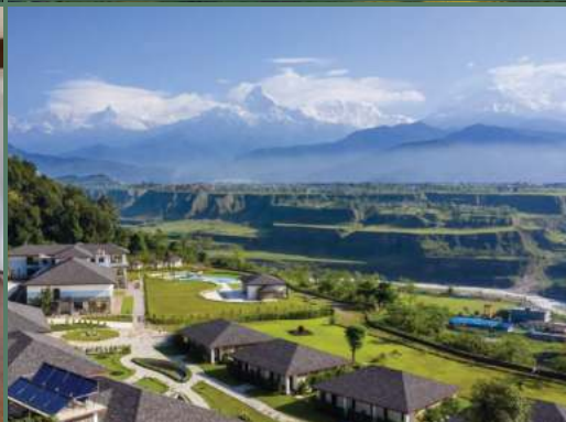
@ Mountain Glory Forest Resort