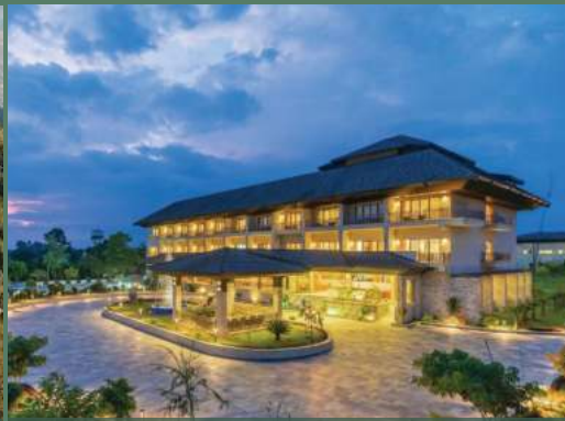
@ Soaltee Westend Resort Local