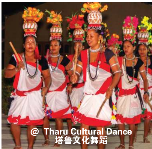
@ Tharu Cultural Dance 塔鲁文化舞蹈