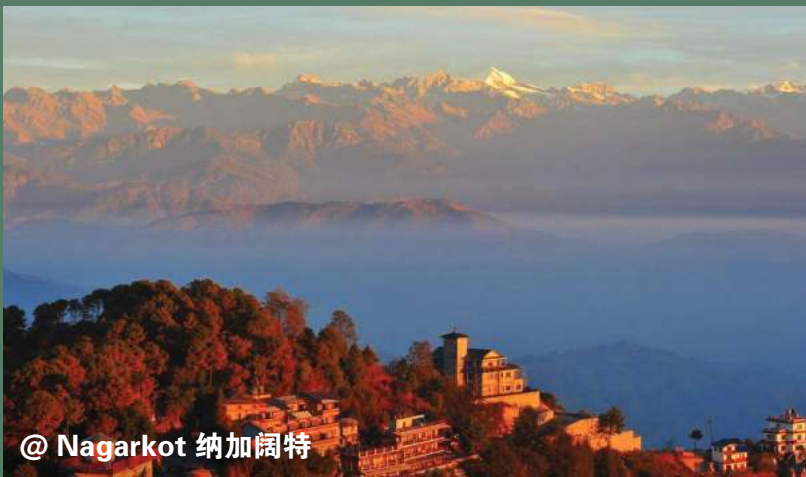
@ Nagarkot 纳加阔特