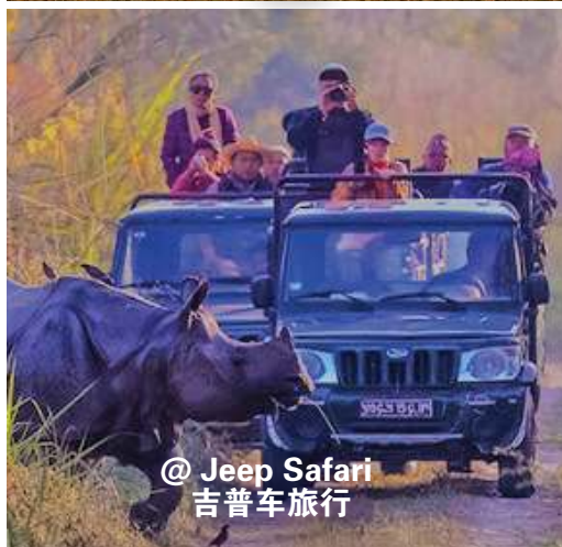
@ Jeep Safari 吉普车旅行