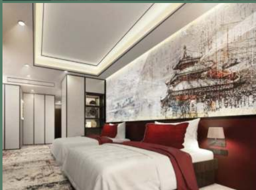
@ Dusit Princess Room