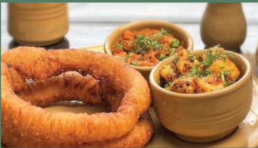
@ Sel Roti