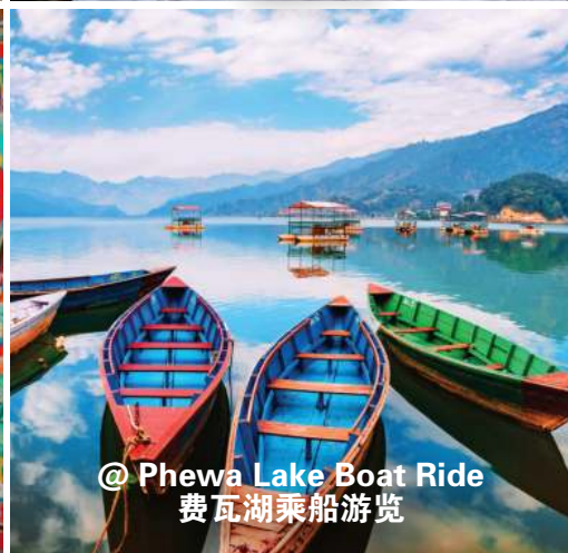
@ Phewa Lake Boat Ride 费瓦湖乘船游览