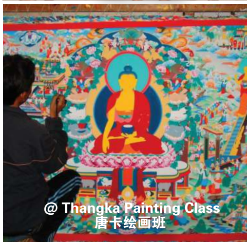
@ Thangka Painting Class 唐卡绘画班