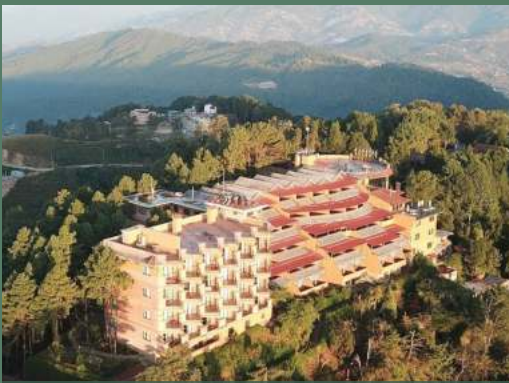
@ Club Himalaya Resort