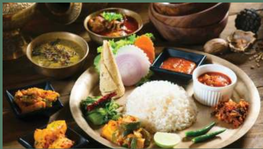
@ Nepali Thali